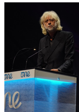
Sir Bob Geldof